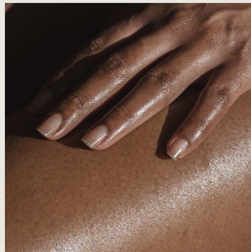
Moving From Magnetism