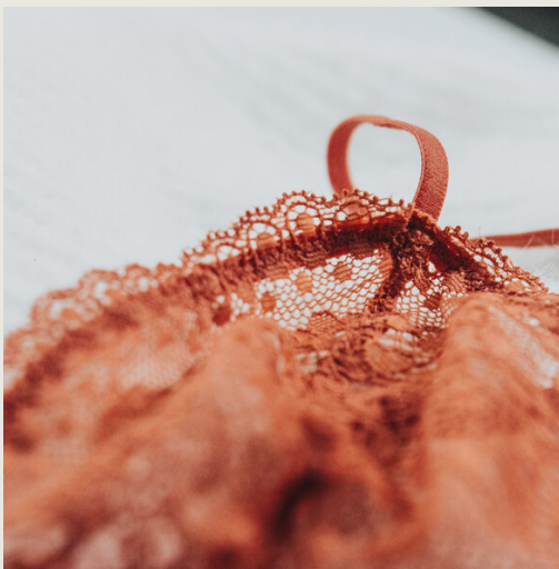
Create A Lifestyle of Romance